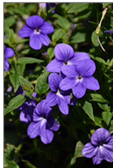
Endless Illumination Browallia flowers

Endless Illumination Browallia is recommended for the following landscape applications;