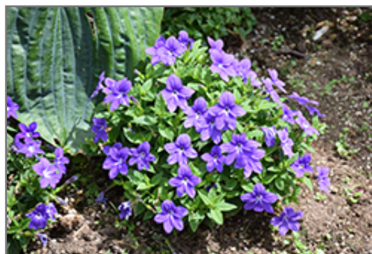
Endless Illumination Browallia in bloom