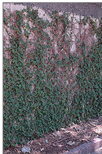
Creeping Fig