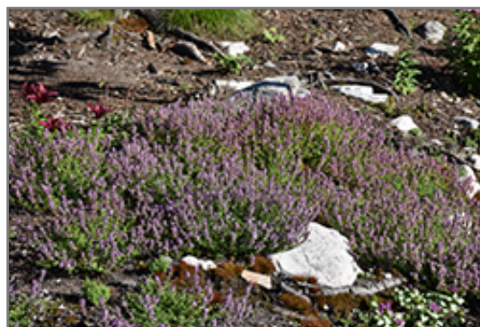
Lemon Thyme in bloom