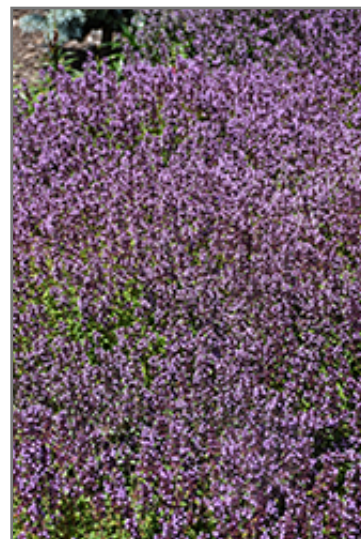
Lemon Thyme in bloom

Lemon Thyme is smothered in stunning spikes of lilac purple flowers rising above the foliage from early to late summer. Its attractive tiny fragrant round leaves remain light green in color throughout the year.