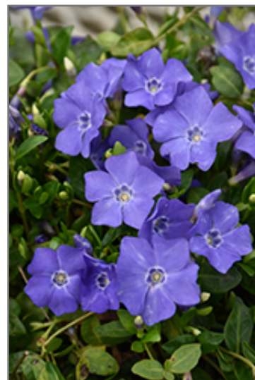
Bowles Periwinkle flowers

This is a high maintenance plant that will require regular care and upkeep, and should not require much pruning, except when necessary, such as to remove dieback. Deer don't particularly care for this plant and will usually leave it alone in favor of tastier treats. Gardeners should be aware of the following characteristic(s) that may warrant special consideration;