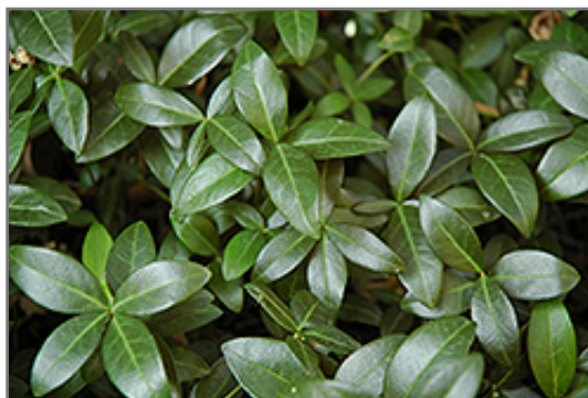
Bowles Periwinkle foliage

Bowles Periwinkle will grow to be only 4 inches tall at maturity extending to 6 inches tall with the flowers, with a spread of 18 inches. Its foliage tends to remain low and dense right to the ground. It grows at a fast rate, and under ideal conditions can be expected to live for approximately 10 years. As an evergreen perennial, this plant will typically keep its form and foliage year-round.