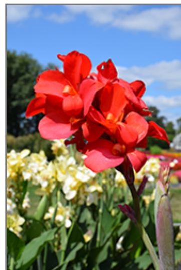
Cannova Bronze Scarlet Canna flowers

Cannova Bronze Scarlet Canna is a fine choice for the garden, but it is also a good selection for planting in outdoor pots and containers. With its upright habit of growth, it is best suited for use as a 'thriller' in the 'spiller-thriller-filler' container combination; plant it near the center of the pot, surrounded by smaller plants and those that spill over the edges. It is even sizeable enough that it can be grown alone in a suitable container. Note that when growing plants in outdoor containers and baskets, they may require more frequent waterings than they would in the yard or garden. Be aware that in our climate, this plant may be too tender to survive the winter if left outdoors in a container. Contact our experts for more information on how to protect it over the winter months.