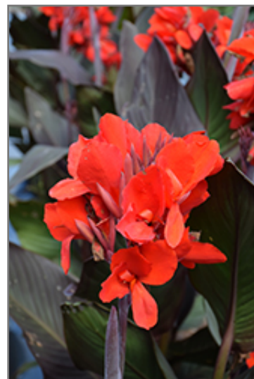
Cannova Bronze Scarlet Canna flowers

This plant is native to the tropics and prefers growing in moist environments with evenly warm conditions all year round. In our climate, it is usually grown as an outdoor annual in the garden or in a container. If you want it to survive the winter, it can be brought in to the house and provided with special care, and then returned to the garden the following season. In its preferred tropical habitat, it can grow to be around 4 feet tall at maturity, with a spread of 20 inches. However, when grown as an annual or when overwintered indoors, it can be expected to perform differently, and its exact height and spread will depend on many factors; you may wish to consult with our experts as to how it might perform in your specific application and growing conditions.