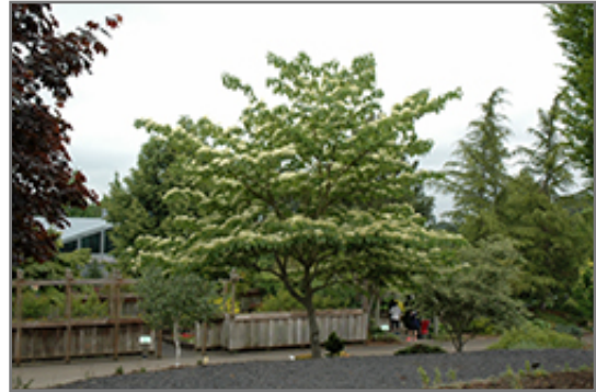
June Snow Giant Dogwood in bloom

This tree does best in full sun to partial shade. It requires an evenly moist well-drained soil for optimal growth, but will die in standing water. It is very fussy about its soil conditions and must have rich, acidic soils to ensure success, and is subject to chlorosis (yellowing) of the foliage in alkaline soils. It is quite intolerant of urban pollution, therefore inner city or urban streetside plantings are best avoided, and will benefit from being planted in a relatively sheltered location. Consider applying a thick mulch around the root zone in winter to protect it in exposed locations or colder microclimates. This is a selected variety of a species not originally from North America.