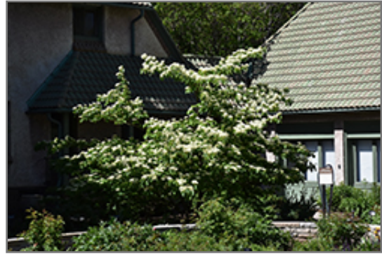
June Snow Giant Dogwood in bloom

June Snow Giant Dogwood is recommended for the following landscape applications;