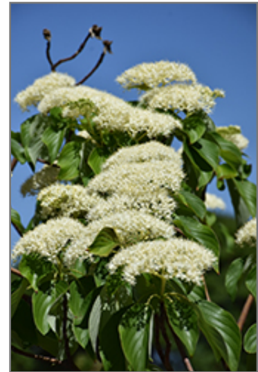
June Snow Giant Dogwood flowers