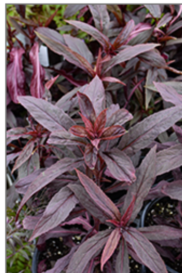
Black Truffle Cardinal Flower foliage

Black Truffle Cardinal Flower is a fine choice for the garden, but it is also a good selection for planting in outdoor pots and containers. With its upright habit of growth, it is best suited for use as a 'thriller' in the 'spiller-thriller-filler' container combination; plant it near the center of the pot, surrounded by smaller plants and those that spill over the edges. It is even sizeable enough that it can be grown alone in a suitable container. Note that when growing plants in outdoor containers and baskets, they may require more frequent waterings than they would in the yard or garden.