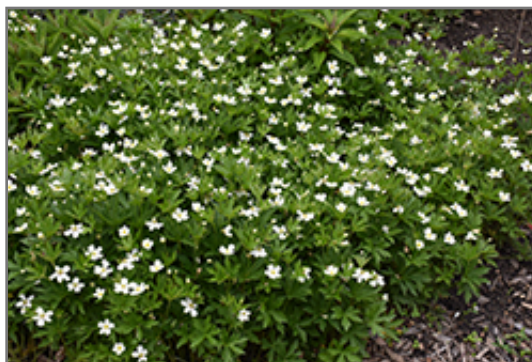
Windflower in bloom

This plant does best in full sun to partial shade. It prefers to grow in average to moist conditions, and shouldn't be allowed to dry out. It is not particular as to soil type or pH. It is somewhat tolerant of urban pollution. This species is not originally from North America. It can be propagated by division.