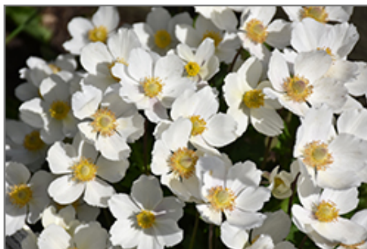
Windflower flowers

Windflower is recommended for the following landscape applications;