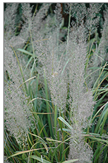
Korean Reed Grass fruit