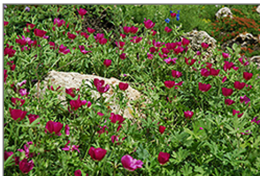
Buffalo Poppy flowers