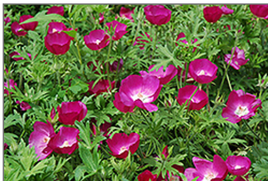
Buffalo Poppy flowers