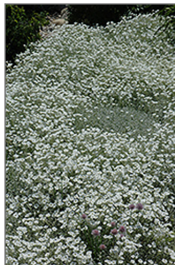
Snow-In-Summer in bloom

Snow-In-Summer will grow to be about 8 inches tall at maturity, with a spread of 24 inches. Its foliage tends to remain low and dense right to the ground. It grows at a fast rate, and under ideal conditions can be expected to live for approximately 10 years. As an evergreen perennial, this plant will typically keep its form and foliage year-round.