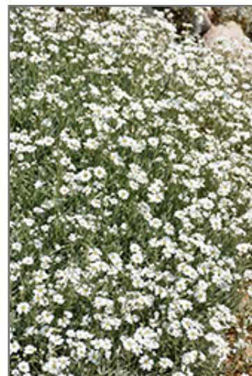
Snow-In-Summer in bloom