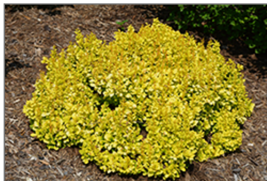
Sunjoy Mini Saffron Japanese Barberry

Sunjoy Mini Saffron Japanese Barberry is recommended for the following landscape applications;