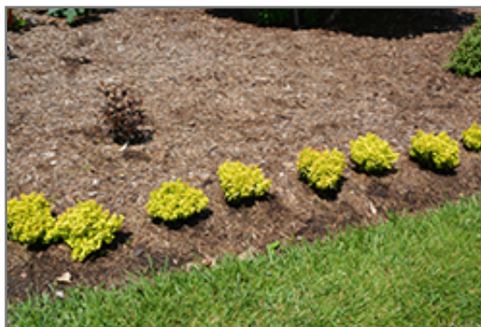
Sunjoy Mini Saffron Japanese Barberry (pruned as hedge)

This shrub does best in full sun to partial shade. It is very adaptable to both dry and moist growing conditions, but will not tolerate any standing water. It is not particular as to soil type or pH, and is able to handle environmental salt. It is highly tolerant of urban pollution and will even thrive in inner city environments. This is a selected variety of a species not originally from North America.