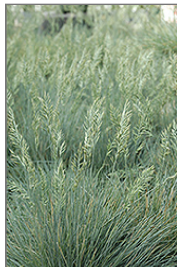
Elijah Blue Fescue foliage