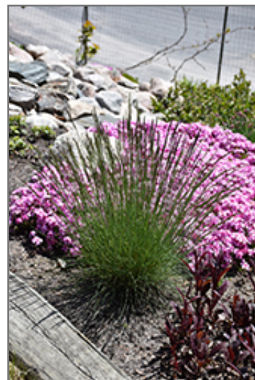
Elijah Blue Fescue in bloom

Elijah Blue Fescue is a fine choice for the garden, but it is also a good selection for planting in outdoor pots and containers. It is often used as a 'filler' in the 'spiller-thriller-filler' container combination, providing a canvas of foliage against which the thriller plants stand out. Note that when growing plants in outdoor containers and baskets, they may require more frequent waterings than they would in the yard or garden.