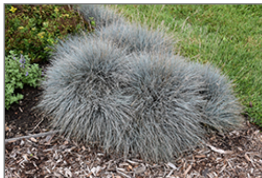
Elijah Blue Fescue

Elijah Blue Fescue is recommended for the following landscape applications;