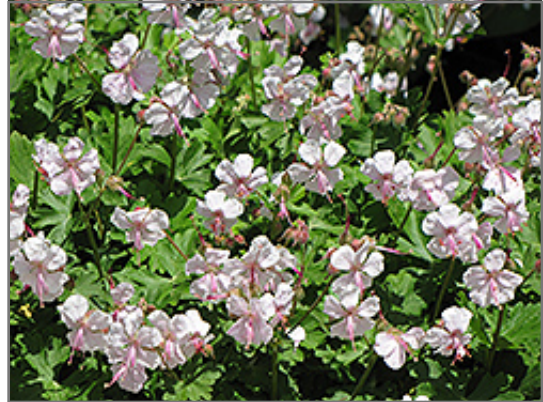
Biokovo Cranesbill in bloom

Biokovo Cranesbill will grow to be about 8 inches tall at maturity, with a spread of 18 inches. When grown in masses or used as a bedding plant, individual plants should be spaced approximately 15 inches apart. Its foliage tends to remain low and dense right to the ground. It grows at a medium rate, and under ideal conditions can be expected to live for approximately 10 years. As an evergreen perennial, this plant will typically keep its form and foliage year-round.