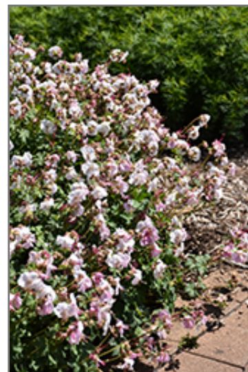
Biokovo Cranesbill flowers