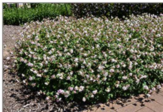
Biokovo Cranesbill in bloom