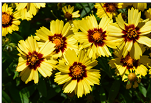
UpTick Yellow and Red Tickseed flowers

UpTick Yellow and Red Tickseed is recommended for the following landscape applications;