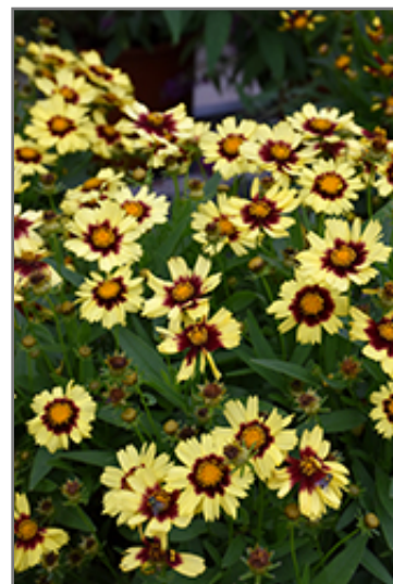
UpTick Yellow and Red Tickseed flowers

UpTick Yellow and Red Tickseed is a fine choice for the garden, but it is also a good selection for planting in outdoor pots and containers. It is often used as a 'filler' in the 'spiller-thriller-filler' container combination, providing a mass of flowers against which the thriller plants stand out. Note that when growing plants in outdoor containers and baskets, they may require more frequent waterings than they would in the yard or garden.