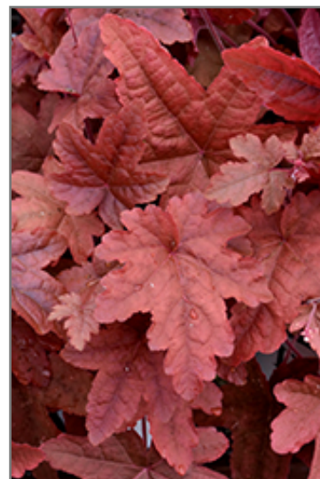
Fun and Games Red Rover Foamy Bells foliage

This is a relatively low maintenance plant, and should be cut back in late fall in preparation for winter. It is a good choice for attracting hummingbirds to your yard. It has no significant negative characteristics.