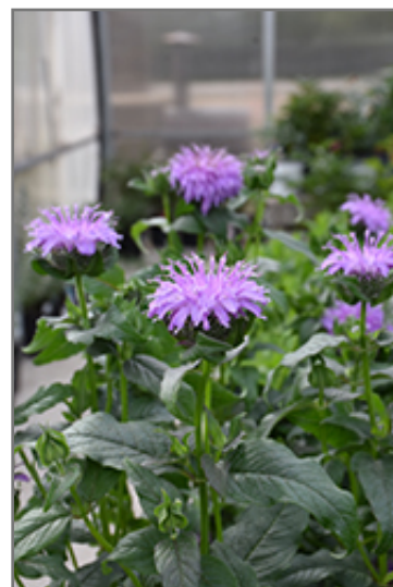
Blue Moon Beebalm flowers