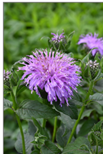
Blue Moon Beebalm flowers