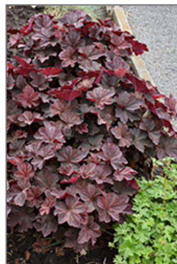
Palace Purple Coral Bells

This is a relatively low maintenance plant, and should be cut back in late fall in preparation for winter. It is a good choice for attracting hummingbirds to your yard. It has no significant negative characteristics.