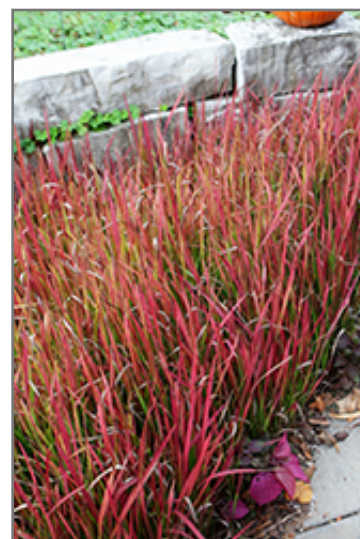
Red Baron Japanese Blood Grass