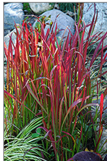
Red Baron Japanese Blood Grass

Red Baron Japanese Blood Grass is a fine choice for the garden, but it is also a good selection for planting in outdoor pots and containers. With its upright habit of growth, it is best suited for use as a 'thriller' in the 'spiller-thriller-filler' container combination; plant it near the center of the pot, surrounded by smaller plants and those that spill over the edges. Note that when growing plants in outdoor containers and baskets, they may require more frequent waterings than they would in the yard or garden.