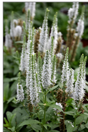
Snow Candles Spike Speedwell flowers