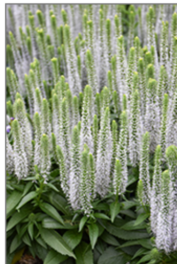
Snow Candles Spike Speedwell flowers