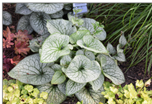
Queen of Hearts Bugloss foliage

Queen of Hearts Bugloss will grow to be about 18 inches tall at maturity extending to 30 inches tall with the flowers, with a spread of 3 feet. When grown in masses or used as a bedding plant, individual plants should be spaced approximately 30 inches apart. It grows at a medium rate, and under ideal conditions can be expected to live for approximately 10 years. As an herbaceous perennial, this plant will usually die back to the crown each winter, and will regrow from the base each spring. Be careful not to disturb the crown in late winter when it may not be readily seen!