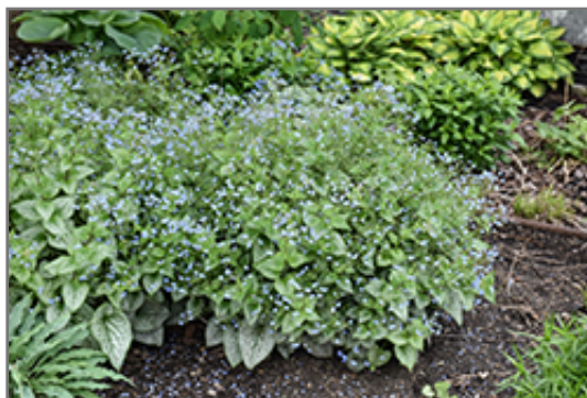
Queen of Hearts Bugloss in bloom

Queen of Hearts Bugloss is recommended for the following landscape applications;