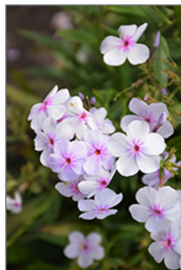
Opening Act Pink-A-Dot Phlox flowers