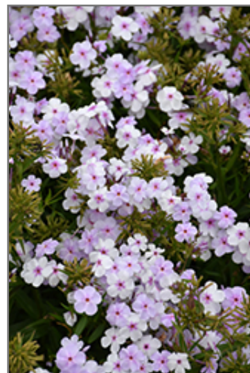
Opening Act Pink-A-Dot Phlox flowers

Opening Act Pink-A-Dot Phlox is recommended for the following landscape applications;