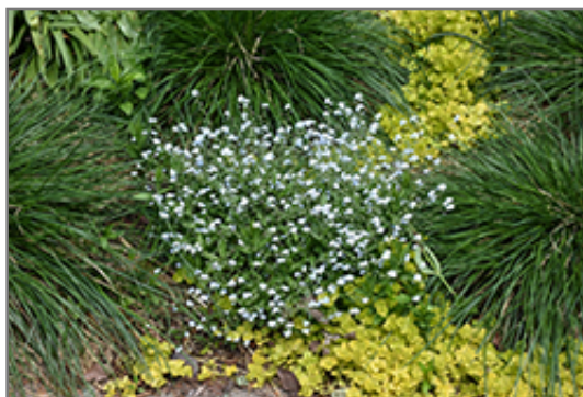
Forget-Me-Not in bloom

This plant does best in partial shade to shade. It prefers to grow in average to moist conditions, and shouldn't be allowed to dry out. It is not particular as to soil type or pH. It is somewhat tolerant of urban pollution. This species is not originally from North America.