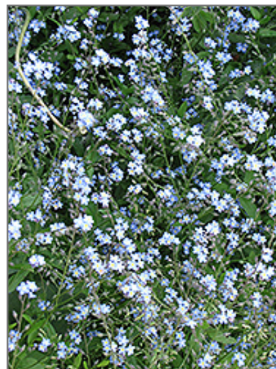
Forget-Me-Not in bloom