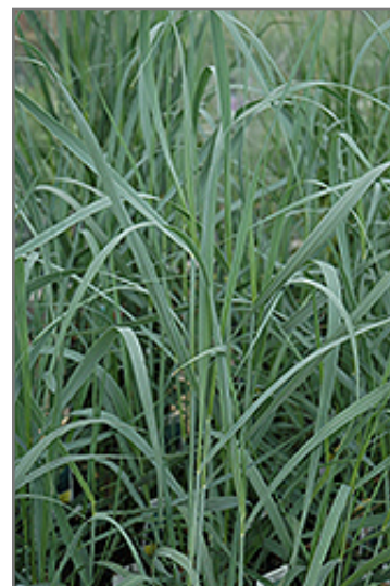
Heavy Metal Blue Switch Grass foliage

This plant does best in full sun to partial shade. It is very adaptable to both dry and moist locations, and should do just fine under typical garden conditions. It is considered to be drought-tolerant, and thus makes an ideal choice for a low-water garden or xeriscape application. It is not particular as to soil type, but has a definite preference for alkaline soils, and is able to handle environmental salt. It is somewhat tolerant of urban pollution. This is a selection of a native North American species. It can be propagated by division; however, as a cultivated variety, be aware that it may be subject to certain restrictions or prohibitions on propagation.