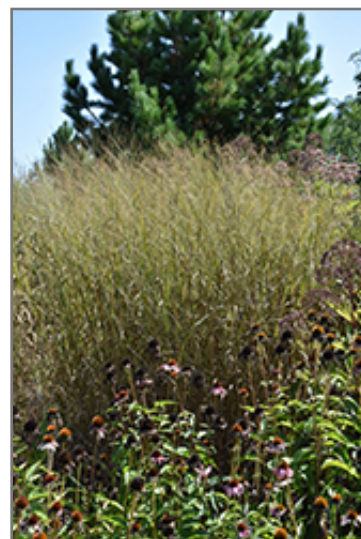
Heavy Metal Blue Switch Grass