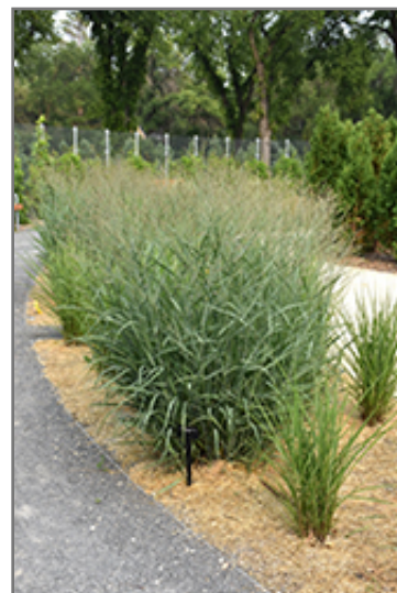
Heavy Metal Blue Switch Grass