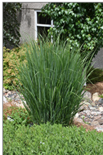
Northwind Switch Grass