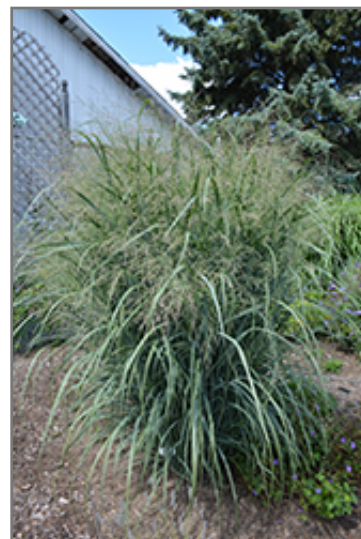
Northwind Switch Grass in bloom

This plant does best in full sun to partial shade. It is very adaptable to both dry and moist locations, and should do just fine under typical garden conditions. It is considered to be drought-tolerant, and thus makes an ideal choice for a low-water garden or xeriscape application. It is not particular as to soil type, but has a definite preference for alkaline soils, and is able to handle environmental salt. It is somewhat tolerant of urban pollution. This is a selection of a native North American species. It can be propagated by division; however, as a cultivated variety, be aware that it may be subject to certain restrictions or prohibitions on propagation.