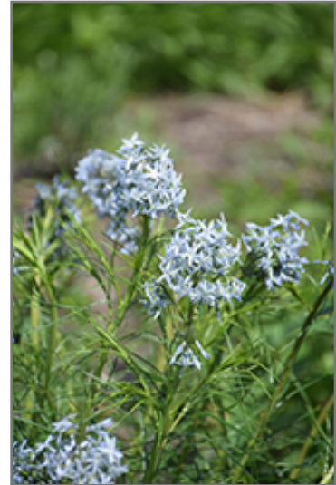
Narrow-Leaf Blue Star flowers