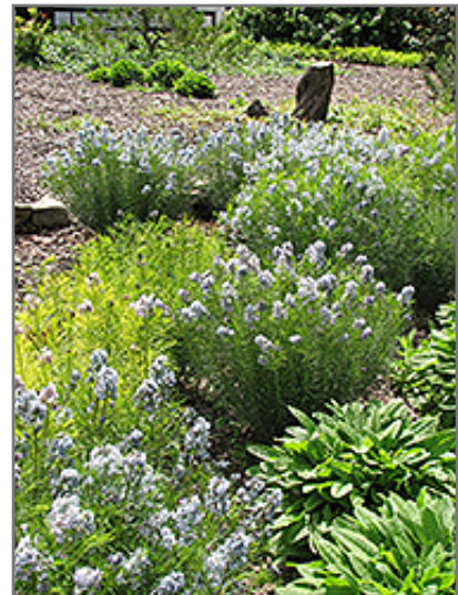
Narrow-Leaf Blue Star in bloom