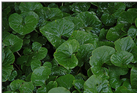
Canadian Wild Ginger