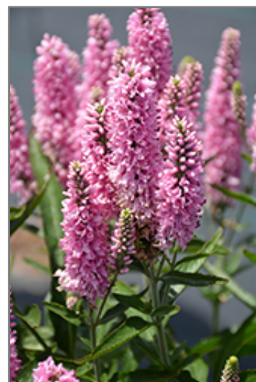
Skyward Pink Long-leaf Speedwell flowers

Skyward Pink Long-leaf Speedwell is a fine choice for the garden, but it is also a good selection for planting in outdoor pots and containers. It is often used as a 'filler' in the 'spiller-thriller-filler' container combination, providing a mass of flowers against which the larger thriller plants stand out. Note that when growing plants in outdoor containers and baskets, they may require more frequent waterings than they would in the yard or garden.