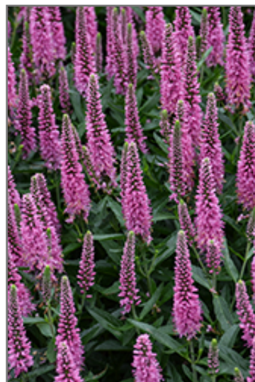
Skyward Pink Long-leaf Speedwell flowers

Skyward Pink Long-leaf Speedwell is recommended for the following landscape applications;