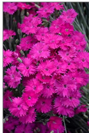
Neon Star Pinks flowers

Neon Star Pinks is recommended for the following landscape applications;