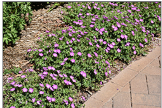
Max Frei Cranesbill in bloom