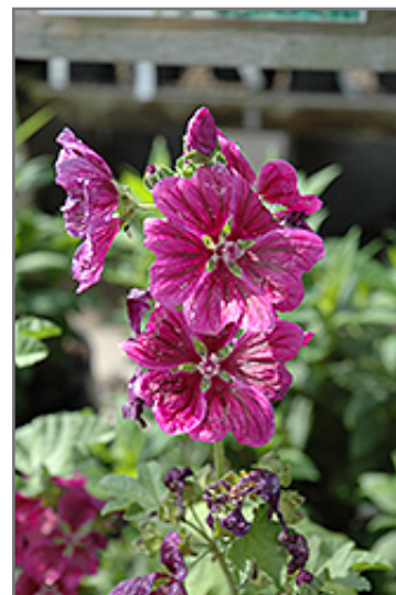
Tree Mallow flowers