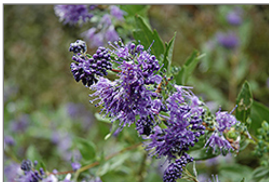
Blue Mist Caryopteris flowers

Blue Mist Caryopteris is recommended for the following landscape applications;