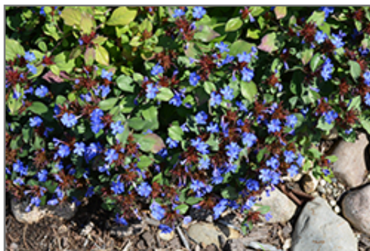
Plumbago in bloom

This plant does best in full sun to partial shade. It does best in average to evenly moist conditions, but will not tolerate standing water. It is not particular as to soil type or pH. It is somewhat tolerant of urban pollution. Consider covering it with a thick layer of mulch in winter to protect it in exposed locations or colder microclimates. This species is not originally from North America. It can be propagated by division.