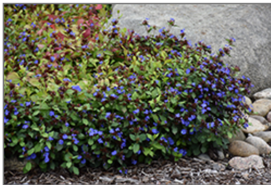
Plumbago in bloom