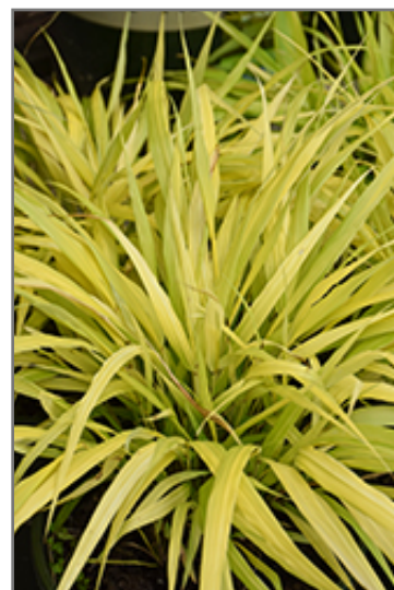
All Gold Hakone Grass foliage