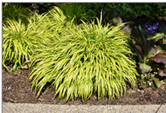
All Gold Hakone Grass