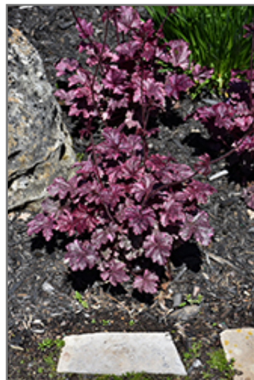
Midnight Rose Coral Bells