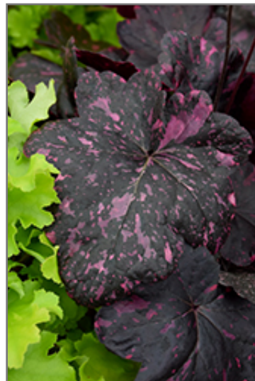
Midnight Rose Coral Bells foliage

Midnight Rose Coral Bells is recommended for the following landscape applications;