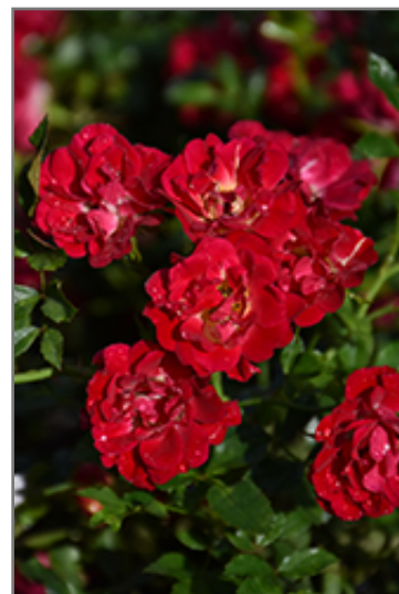
Red Drift Rose flowers

Red Drift Rose makes a fine choice for the outdoor landscape, but it is also well-suited for use in outdoor pots and containers. Because of its spreading habit of growth, it is ideally suited for use as a 'spiller' in the 'spiller-thriller-filler' container combination; plant it near the edges where it can spill gracefully over the pot. Note that when grown in a container, it may not perform exactly as indicated on the tag - this is to be expected. Also note that when growing plants in outdoor containers and baskets, they may require more frequent waterings than they would in the yard or garden.