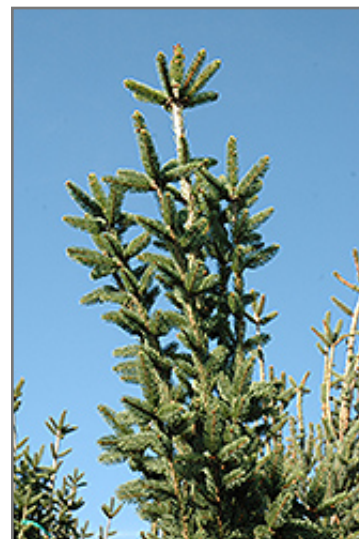
Columnar Norway Spruce foliage