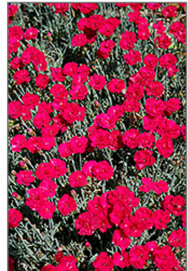
Frosty Fire Pinks flowers