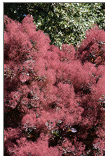
Royal Purple Smokebush flowers

Royal Purple Smokebush is recommended for the following landscape applications;