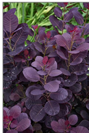
Royal Purple Smokebush foliage