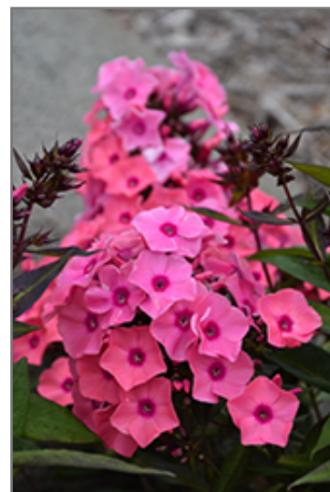
Coral Creme Drop Garden Phlox flowers