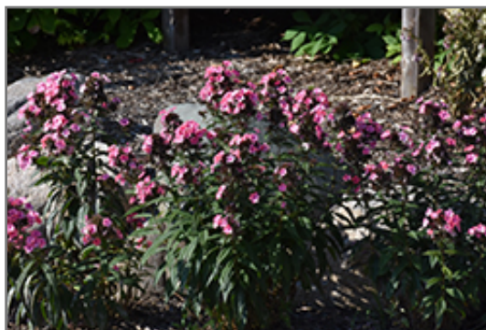
Coral Creme Drop Garden Phlox in bloom

Coral Creme Drop Garden Phlox will grow to be about 18 inches tall at maturity extending to 24 inches tall with the flowers, with a spread of 18 inches. When grown in masses or used as a bedding plant, individual plants should be spaced approximately 15 inches apart. It grows at a medium rate, and under ideal conditions can be expected to live for approximately 10 years. As an herbaceous perennial, this plant will usually die back to the crown each winter, and will regrow from the base each spring. Be careful not to disturb the crown in late winter when it may not be readily seen!