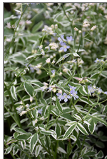
Touch Of Class Jacob's Ladder flowers

This plant does best in full sun to partial shade. It does best in average to evenly moist conditions, but will not tolerate standing water. It is not particular as to soil type or pH. It is somewhat tolerant of urban pollution. This is a selected variety of a species not originally from North America. It can be propagated by division; however, as a cultivated variety, be aware that it may be subject to certain restrictions or prohibitions on propagation.