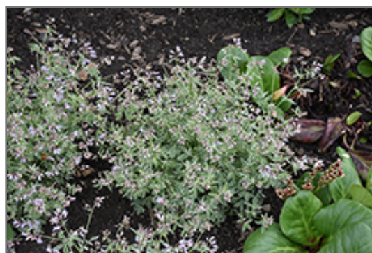
Touch Of Class Jacob's Ladder in bloom