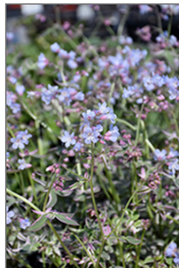
Touch Of Class Jacob's Ladder flowers

Touch Of Class Jacob's Ladder is an herbaceous perennial with tall flower stalks held atop a low mound of foliage. It brings an extremely fine and delicate texture to the garden composition and should be used to full effect.