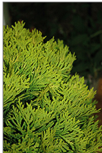
Anna's Magic Ball Arborvitae foliage