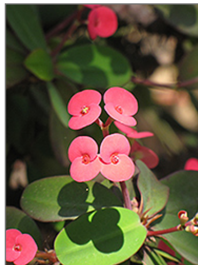
Crown Of Thorns flowers

Crown Of Thorns is recommended for the following landscape applications;