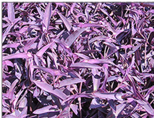
Purple Heart Spider Lily foliage

When grown indoors, Purple Heart Spider Lily can be expected to grow to be about 10 inches tall at maturity, with a spread of 24 inches. It grows at a fast rate, and under ideal conditions can be expected to live for approximately 10 years. This houseplant will do well in a location that gets either direct or indirect sunlight, although it will usually require a more brightly-lit environment than what artificial indoor lighting alone can provide. It prefers to grow in average to moist soil. The surface of the soil shouldn't be allowed to dry out completely, and so you should expect to water this plant once and possibly even twice each week. Be aware that your particular watering schedule may vary depending on its location in the room, the pot size, plant size and other conditions; if in doubt, ask one of our experts in the store for advice. It is not particular as to soil type or pH; an average potting soil should work just fine.