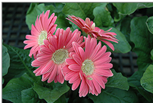
Pink Gerbera Daisy flowers

When grown indoors, Pink Gerbera Daisy can be expected to grow to be about 12 inches tall at maturity extending to 16 inches tall with the flowers, with a spread of 12 inches. It grows at a fast rate, and under ideal conditions can be expected to live for approximately 3 years. This houseplant will do well in a location that gets either direct or indirect sunlight, although it will usually require a more brightly-lit environment than what artificial indoor lighting alone can provide. It does best in average to evenly moist soil, but will not tolerate standing water. The surface of the soil shouldn't be allowed to dry out completely, and so you should expect to water this plant once and possibly even twice each week. Be aware that your particular watering schedule may vary depending on its location in the room, the pot size, plant size and other conditions; if in doubt, ask one of our experts in the store for advice. It is not particular as to soil type or pH; an average potting soil should work just fine.