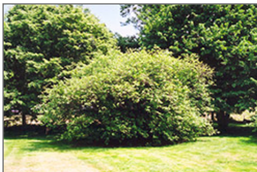
American Hazelnut

This plant is typically grown in a designated edibles garden. It performs well in both full sun and full shade. It is very adaptable to both dry and moist locations, and should do just fine under average home landscape conditions. It is considered to be drought-tolerant, and thus makes an ideal choice for xeriscaping or the moisture-conserving landscape. It is not particular as to soil type or pH. It is highly tolerant of urban pollution and will even thrive in inner city environments. This species is native to parts of North America.