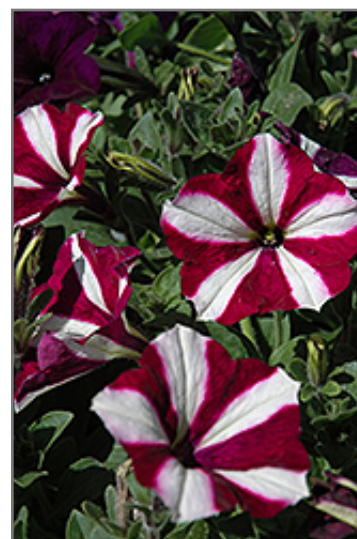
Easy Wave Burgundy Star Petunia flowers

Easy Wave Burgundy Star Petunia is recommended for the following landscape applications;