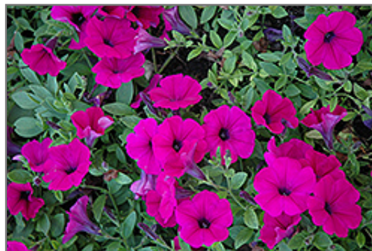
Wave Purple Classic Petunia flowers