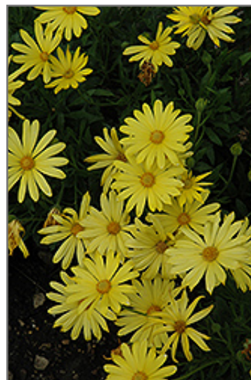
Voltage Yellow African Daisy flowers