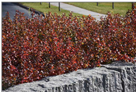
Gro-Low Fragrant Sumac in fall

This shrub performs well in both full sun and full shade. It is very adaptable to both dry and moist locations, and should do just fine under typical garden conditions. It is not particular as to soil type, but has a definite preference for acidic soils, and is subject to chlorosis (yellowing) of the foliage in alkaline soils. It is highly tolerant of urban pollution and will even thrive in inner city environments. Consider applying a thick mulch around the root zone in winter to protect it in exposed locations or colder microclimates. This is a selection of a native North American species.